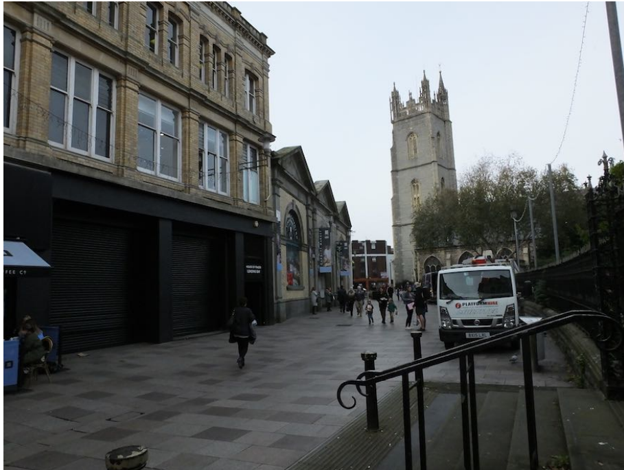
Trinity Street with St John's beyond. The Market's only street elevation.