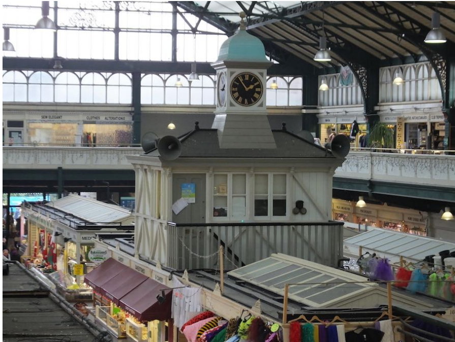
The market manager's office, still in use today. Note also the goods and various accretions hung in front of the stalls in the foreground that detracts from the designed uniformity of the stalls.