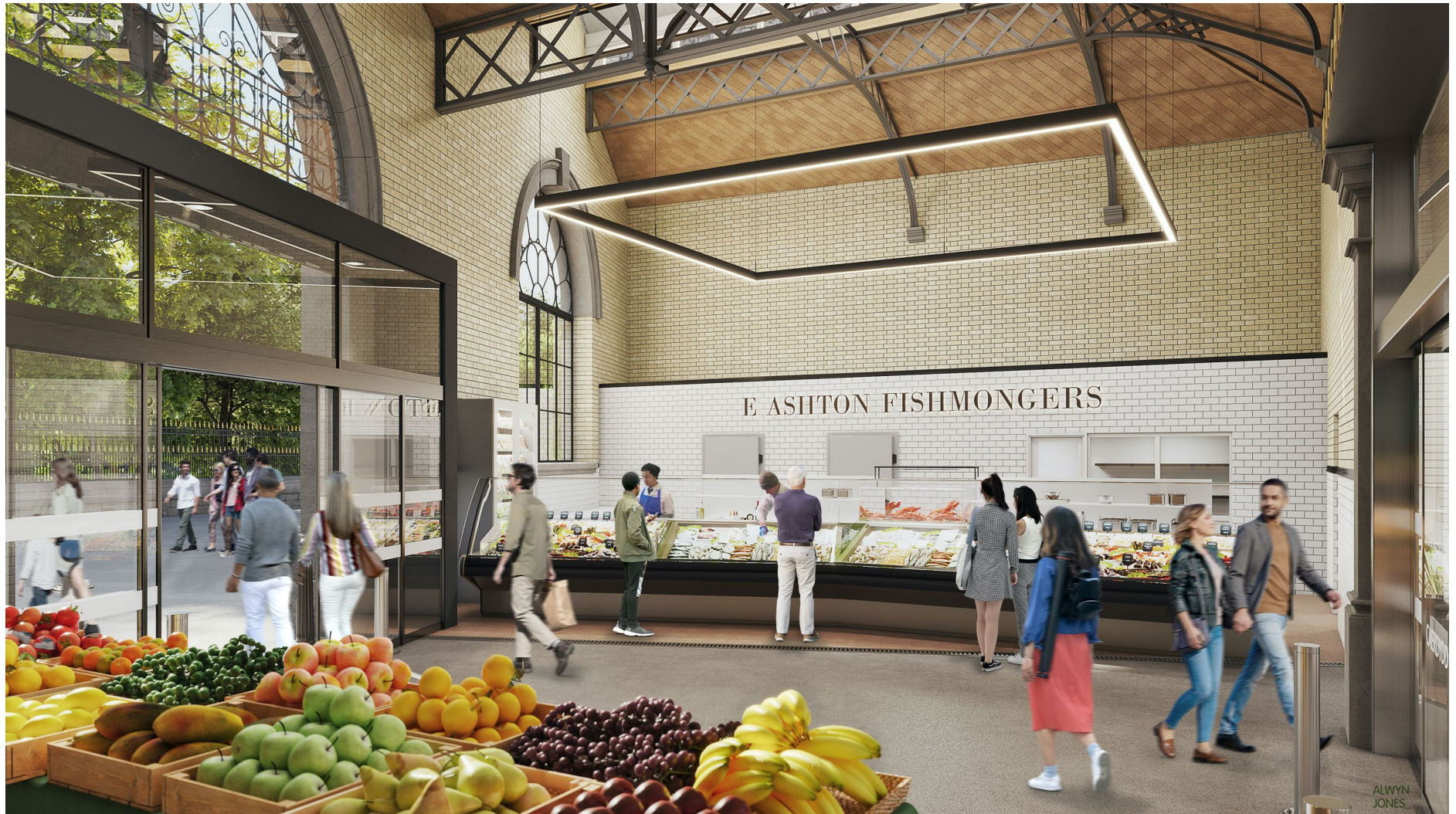
CGI of New arrangement to Fish Market. Modern mezzanine floor removed, original form of market reintroduced and fish stall refurbished.