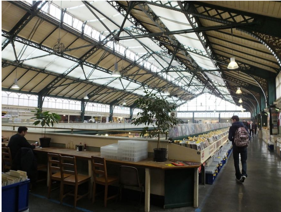
Fine Victorian engineering to the Market roof with lattice trusses.