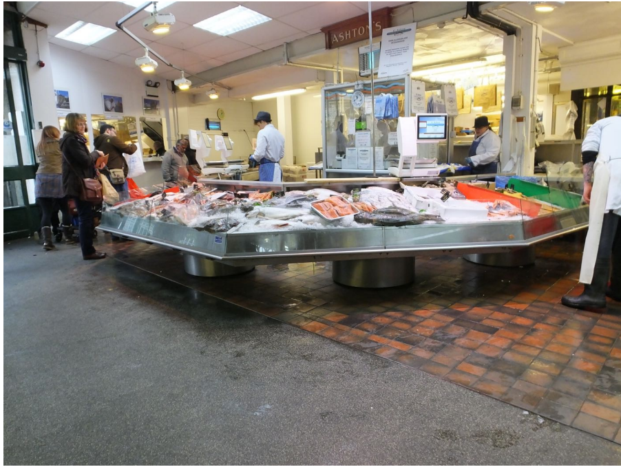
The fish market stall has been much adapted with a new mezzanine floor added (believed to be during 1960's) which conceals much of its original fine character. It is proposed to remove this intervention and refurbish the area.