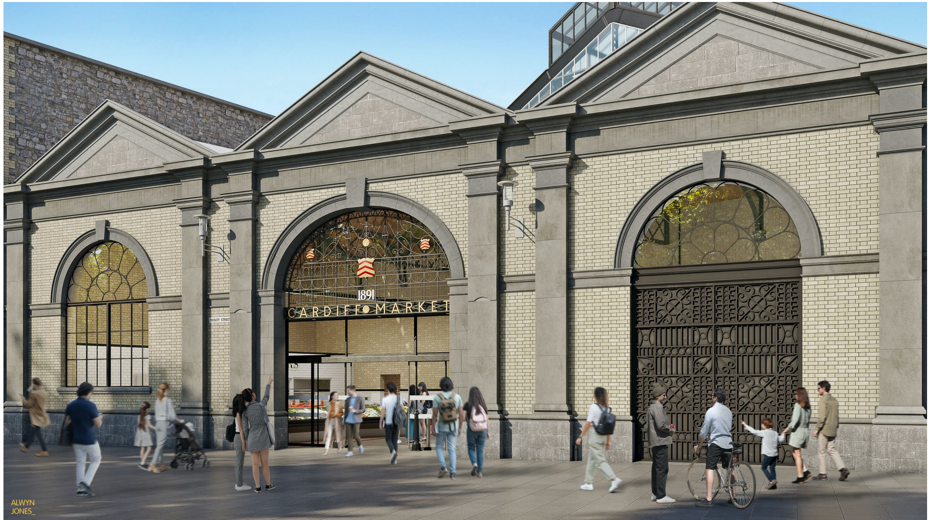
CGI View of Trinity Street elevation.

Modern Accretions removed, elevation cleaned and refurbished with new entrance doors and gates to side opening.