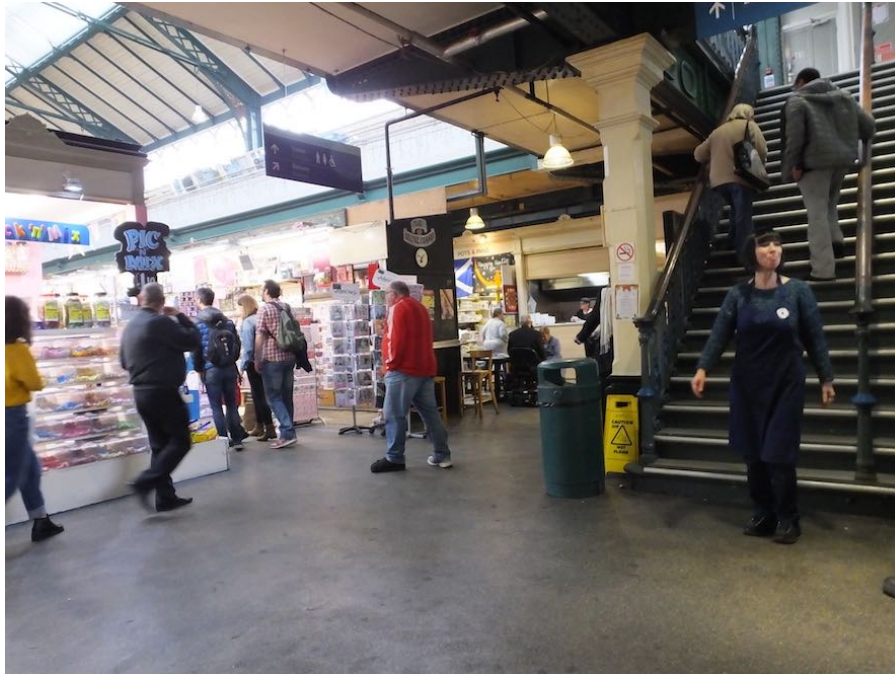
Market hall interior with fine ironwork columns and gallery structure but not shown to its full potential.