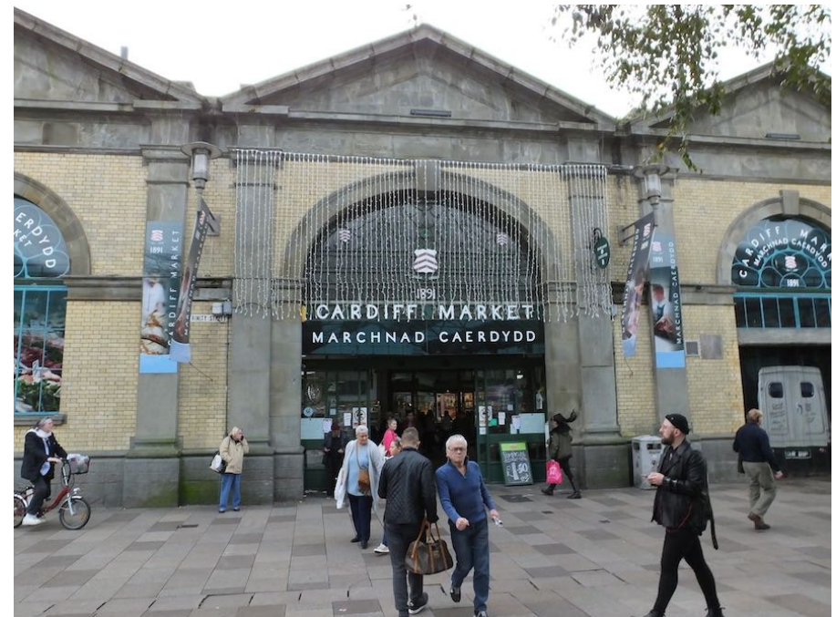
Trinity Street entrance with fine cast iron work tracery not given the prominence it deserves