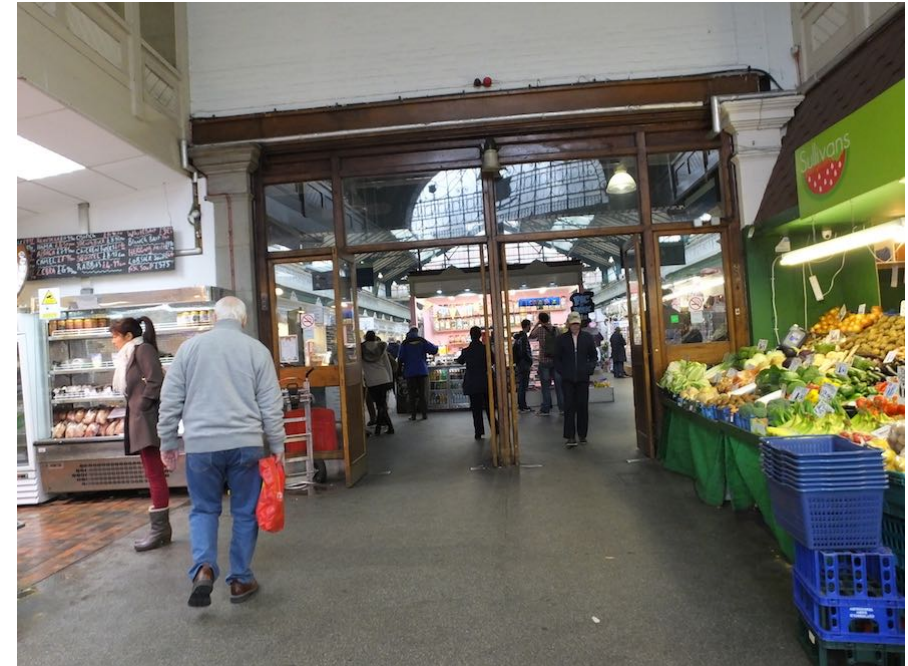
New purpose made Welsh language signage is proposed to be installed above the inner door. Inner doors to be replaced. Current stall installations conceal many of the buildings fine features eg pilasters