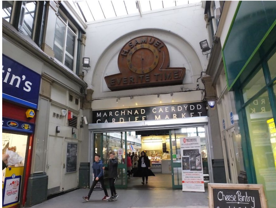
St Mary Street entrance with H Samuel neon clock – to be refurbished. New signage to be provided to entrance and passage to be refurbished generally.