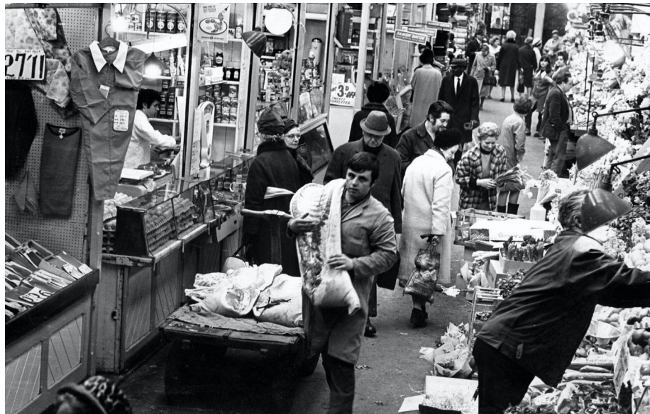
General view of the market 1969