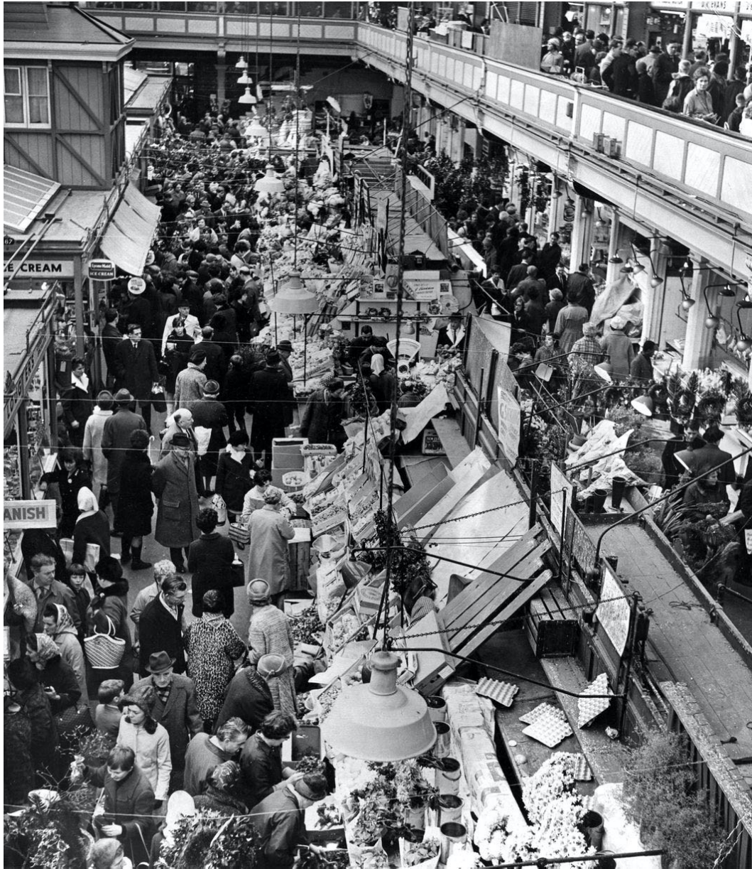
The Market in full swing - Christmas Eve 1967