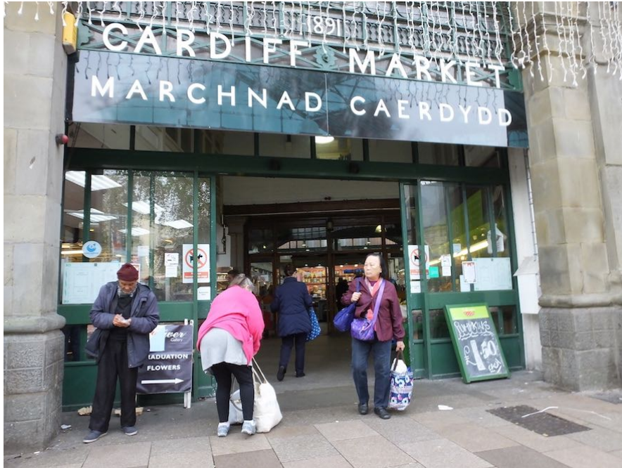
Entrance doors. Recently applied Welsh signage is a distraction from the cast iron tracery. Doors to be replaced and ironwork above refurbished.