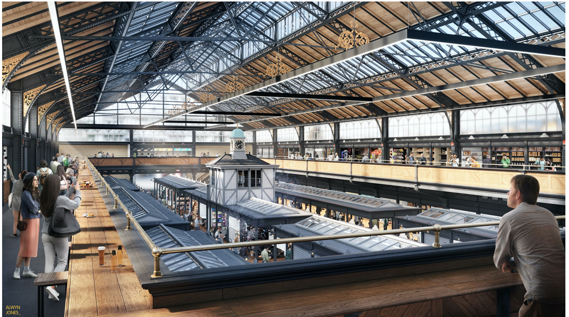
CGI View of Market Hall from gallery. Modern paint finishes stripped off key components, refurbished interior and ground floor stalls.