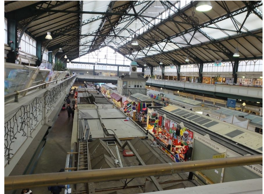
The Market viewed from the gallery. The closest row of stalls have been constructed ad-hoc in place of an original table-top stall arrangement and are of poor quality. These stalls are to be replaced with new enclosures based on the design of the original centre aisle stalls.