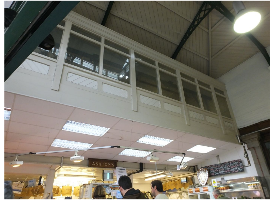
View of the added mezzanine first floor structure and screen which is to be removed. Note the visible elements of the finely detailed roof structure of the original fish market above.