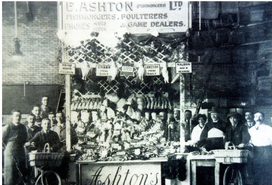
Ashtons, fishmongers circa 1900 and 1985