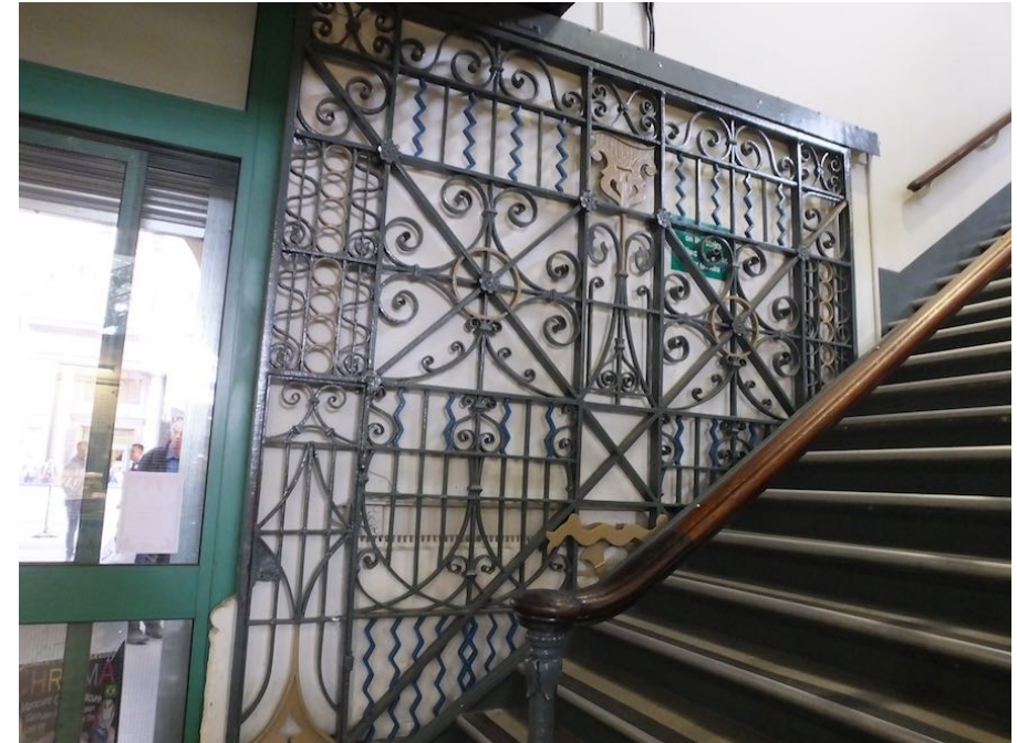
The fine sliding steel gates to the St Mary Street entrance.