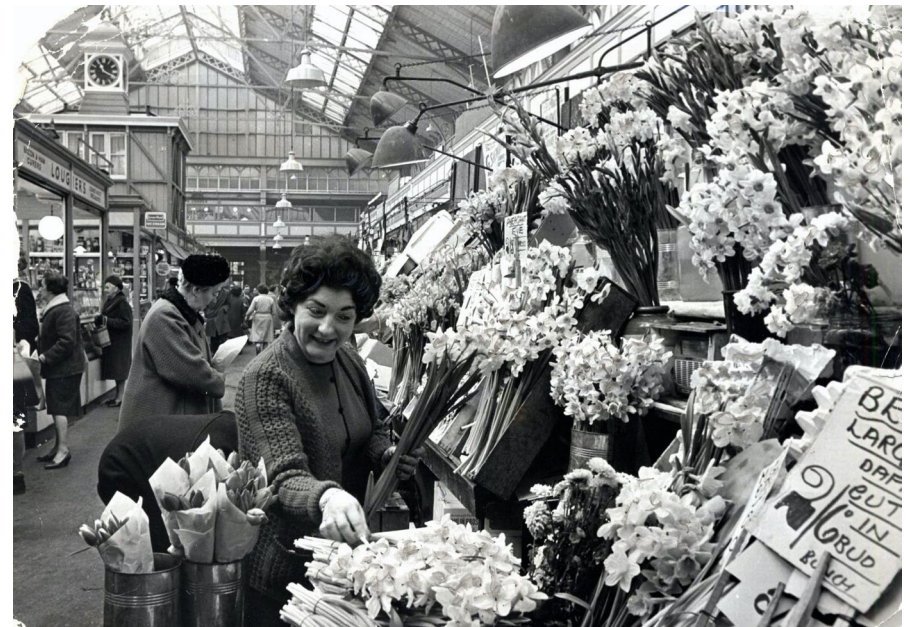
Flower Stall 1965