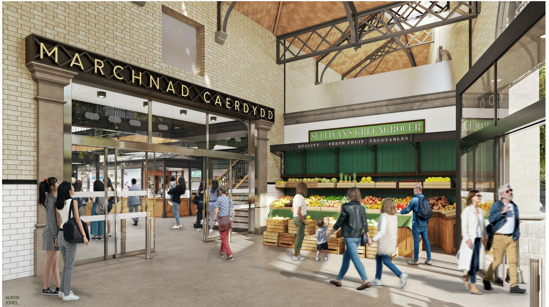
CGI of New arrangement to Fish Market. New market hall entrance doors and first floor Education Suite above Bin Store.