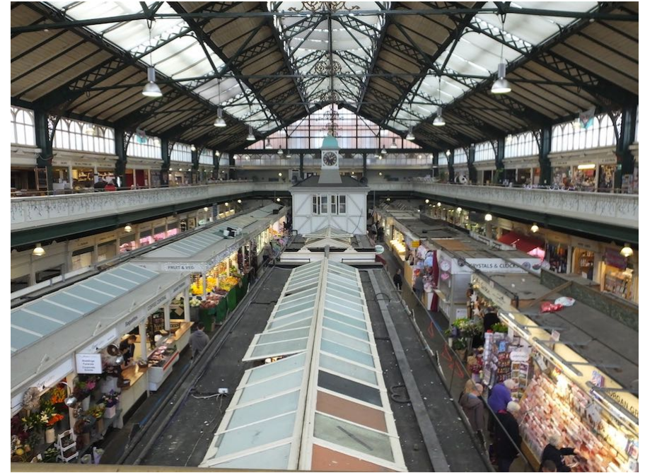
View from gallery. Note that the stalls to the left and centre aisles have been refurbished (2010) with improved roof arrangements, although numerous buckets have been placed on the roof of the left aisle to catch drips from the roof above.