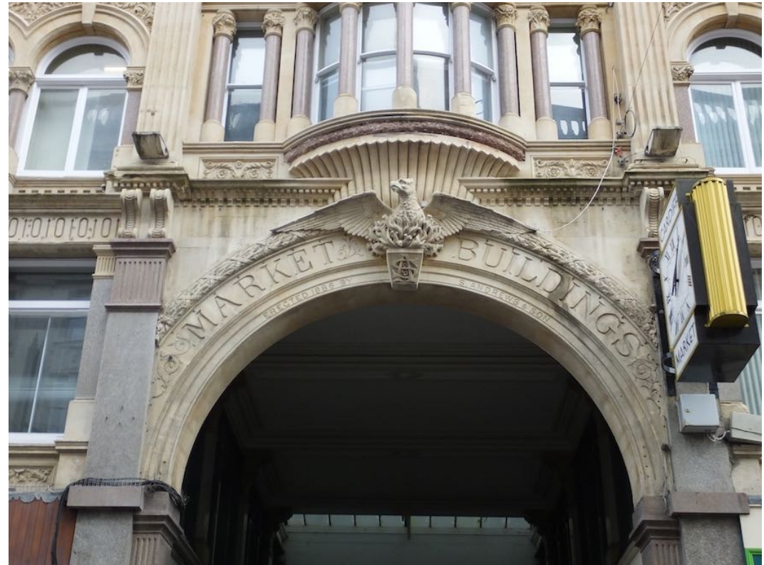
The phoenix carved into the arch of Market Buildings signifying its re-construction following the fire of 1885.