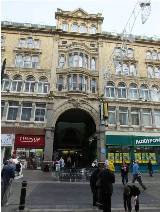
St Mary Street entrance beneath the arch to Market Buildings