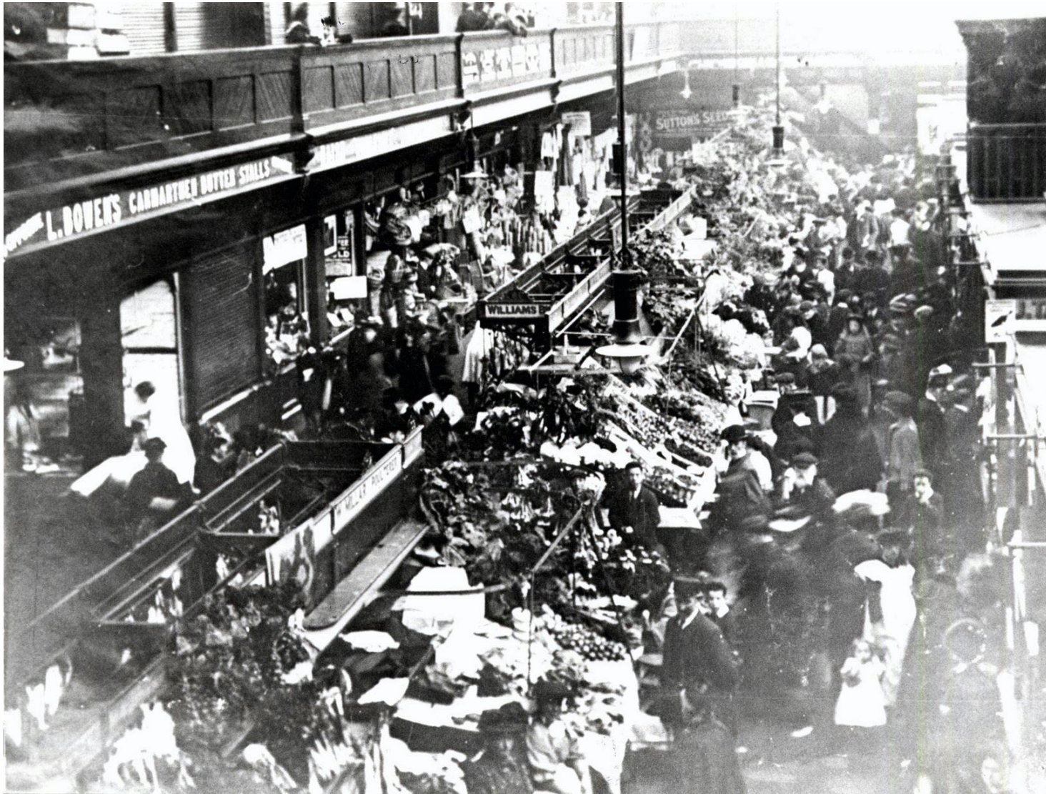
Central Market Hall circa 1895

Note darker colour scheme and also table top stores to the side aisles