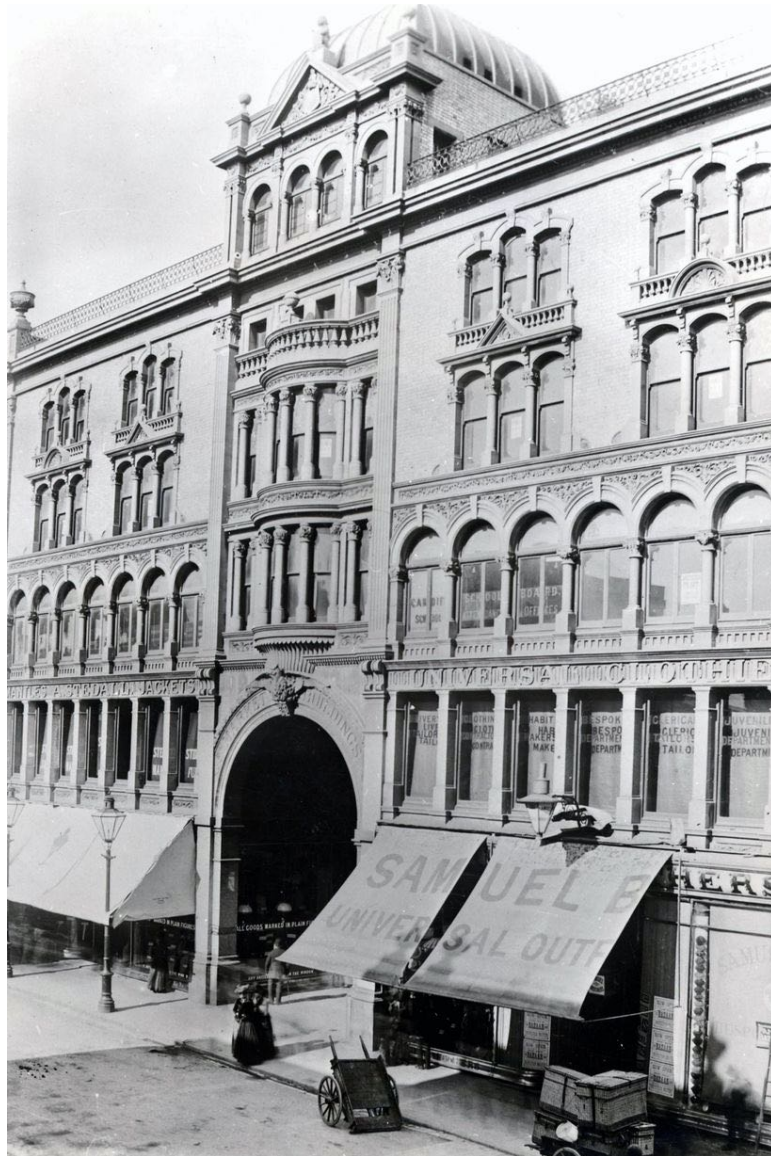
St Mary Street Entrance circa 1895 and 1975